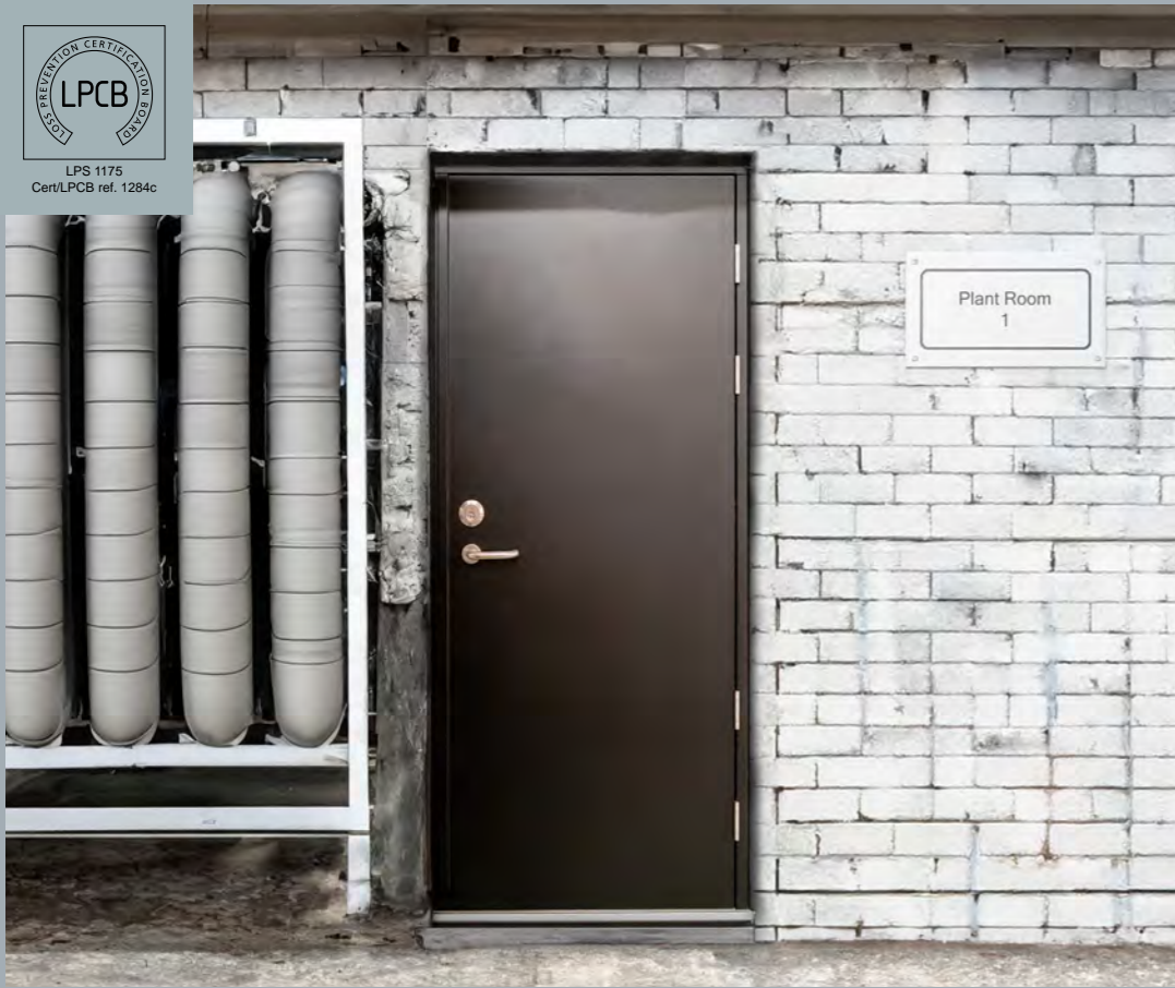
The Defender Xtreme B3 (SR2) doorset comes with a wide range of options including inward opening.